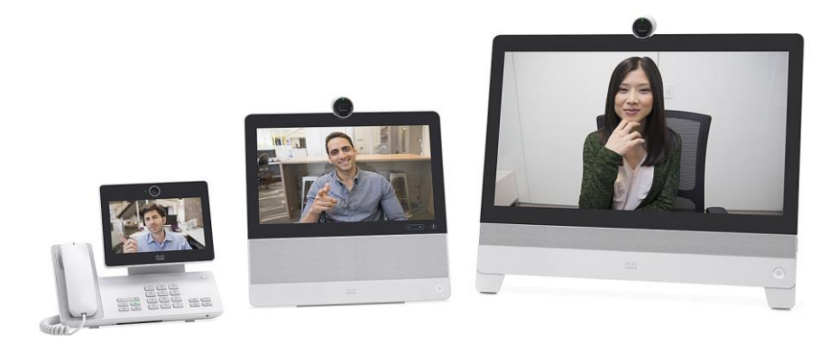
Figure 2. Cisco DX Series—DX650, DX70, and DX80

The Cisco DX Series (Figure 2) includes: