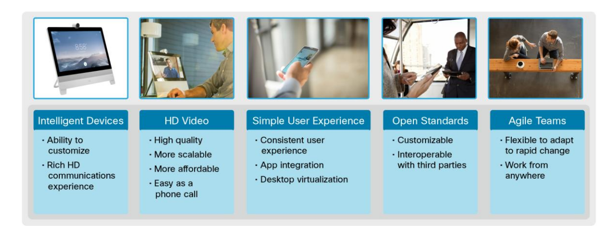
Figure 1. Evolving Trends That Are Shaping a New Era in Enterprise Communications

These factors and others are prompting companies to adopt collaboration solutions that go beyond basic voice communications and include an array of features and integration capabilities (Figure 1).