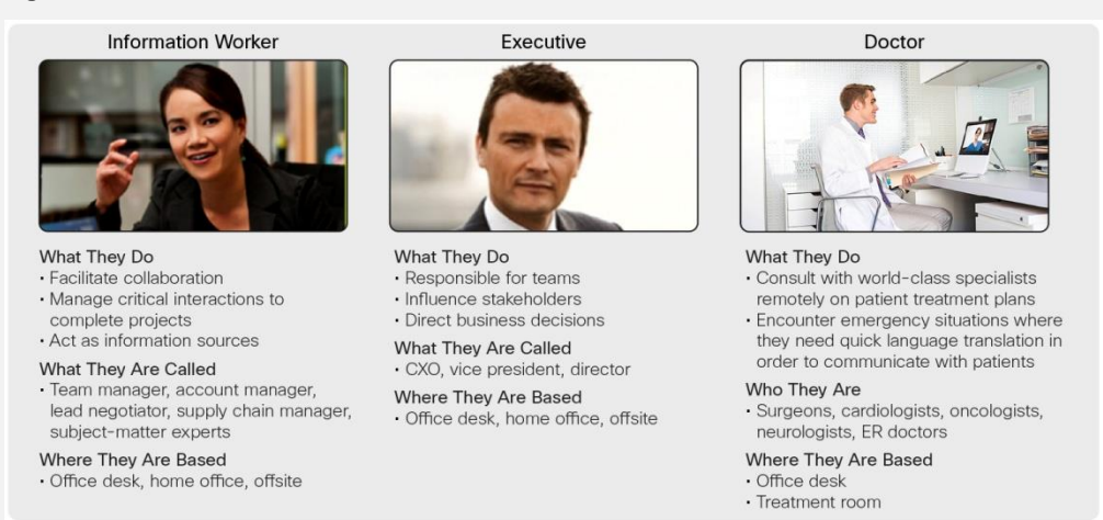
Figure 4. The Cisco DX Series Meets the Collaboration Needs of Different Roles

Figure 4 shows examples of some of the ways the Cisco DX Series can encourage dynamic collaboration: