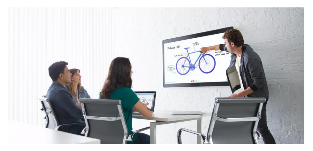
Figure 1. White Boarding Capability on Cisco Spark Board

The Cisco Spark<sup>™</sup> Board is a 3-in-1 device that provides everything you need to collaborate with your teams in physical meeting rooms: You can wirelessly present, white board, and have video and audio calls. And it securely connects to your virtual teams through the Cisco Spark service via your Cisco Spark app-enabled devices, so you can take your meetings and content on the road.