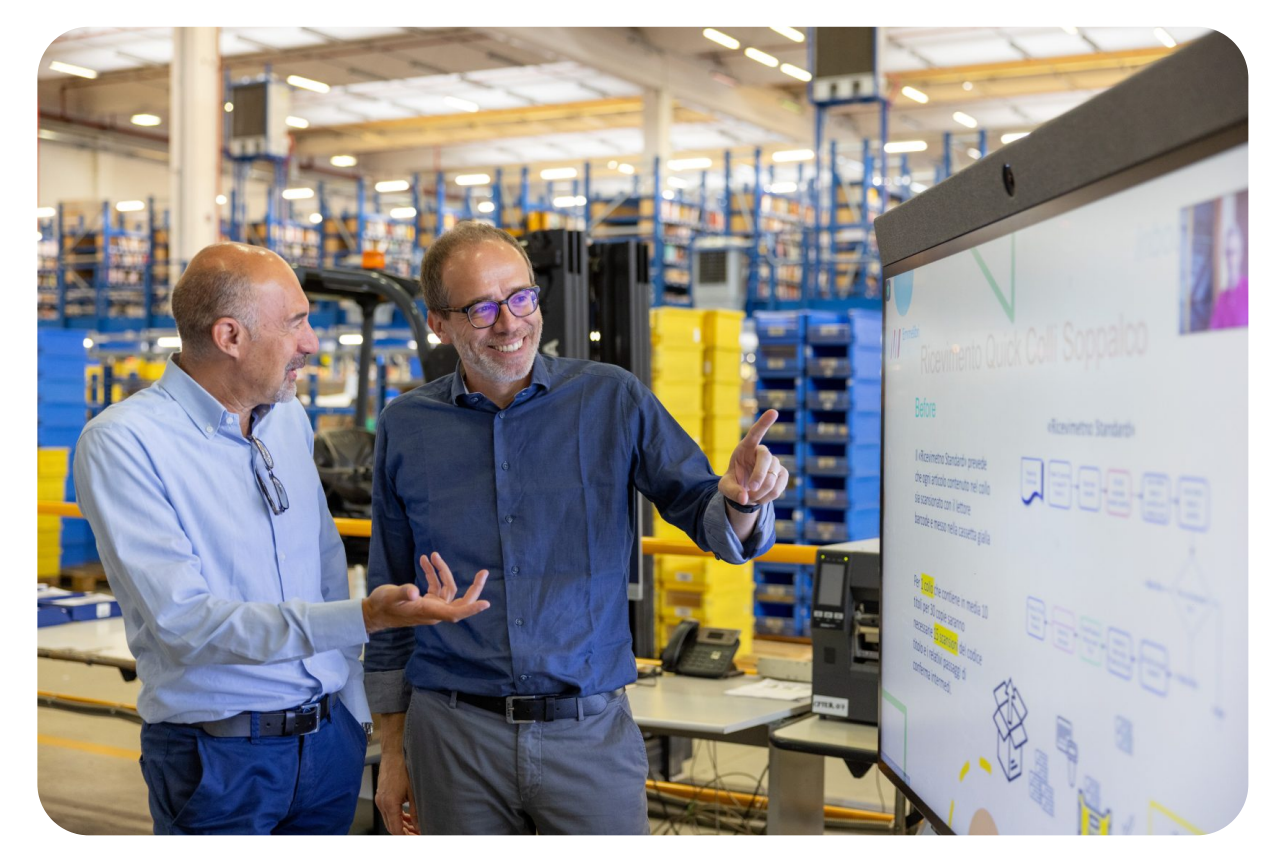
Interacting with the Neat Board.

Yes, we fell in love with these devices for many reasons. The packaging is one. It's so easy. You open up the box and you have all the instructions, the QR code, all the screwdrivers. It's absolutely stunning. We fell in love with this approach, and then of course, with the devices.