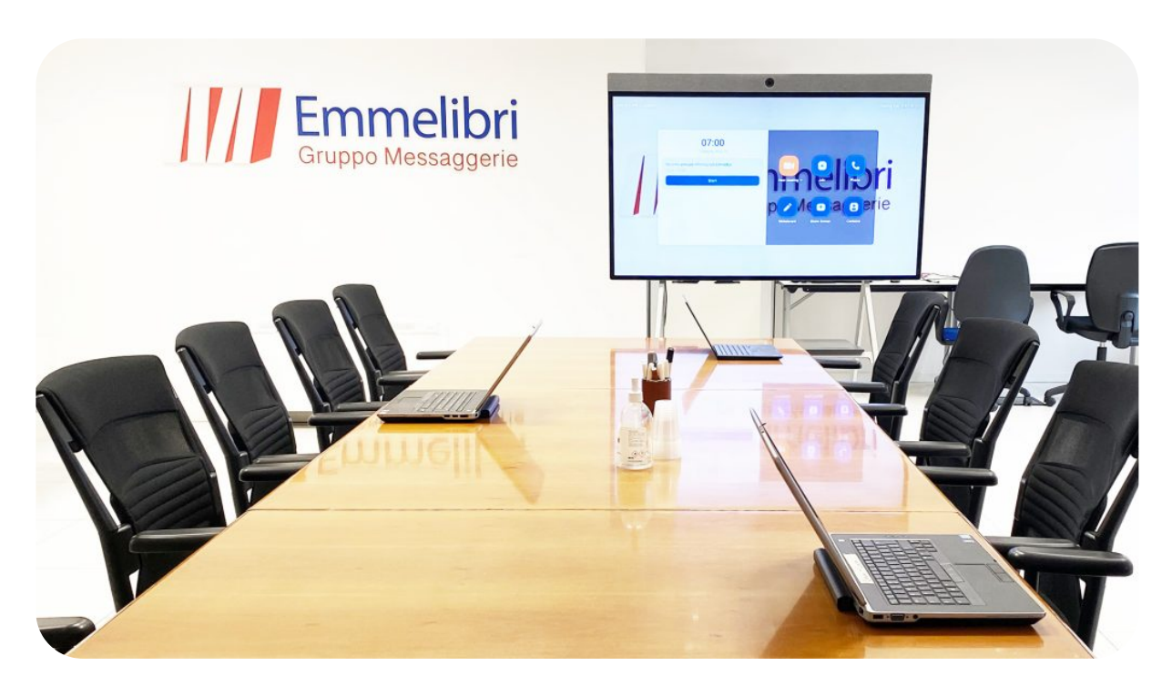
Neat Board in Emmelibri board room

With the old way of doing things, the cleaning people may have accidentally switched something off, then suddenly people are screaming at their assistants to call IT... We love Neat, because it's power on and it's going to work, that's it.